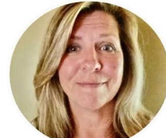
Lisa Shock Training & Communications